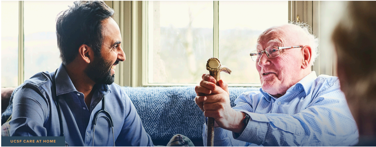
UCSF CARE AT HOME