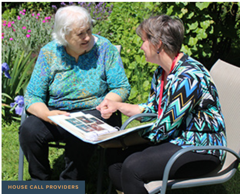
HOUSE CALL PROVIDERS